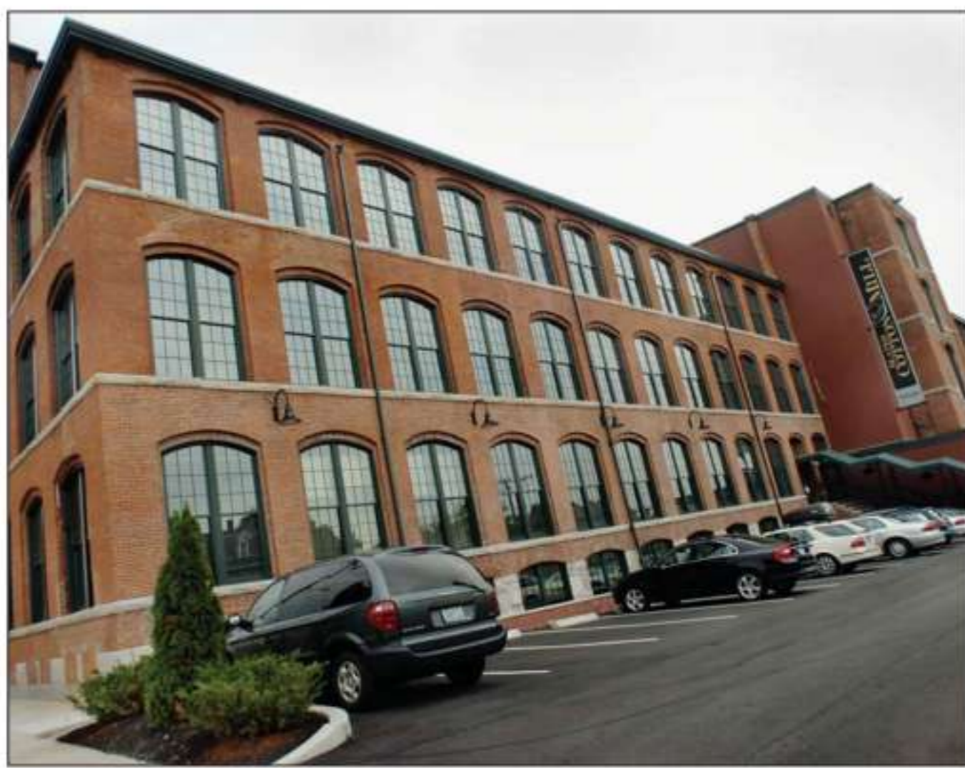
Top, a view of the living room in a one-bedroom unit. Middle right, Above, the exterior of the Slater Cotton Mill apartments, located at 75 South Union Street in Pawtucket, from the South Union Street side of the apartment complex.